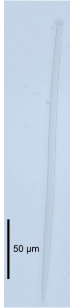
Figure S1. Multilobed tylostyle in specimen WAMZ83371.