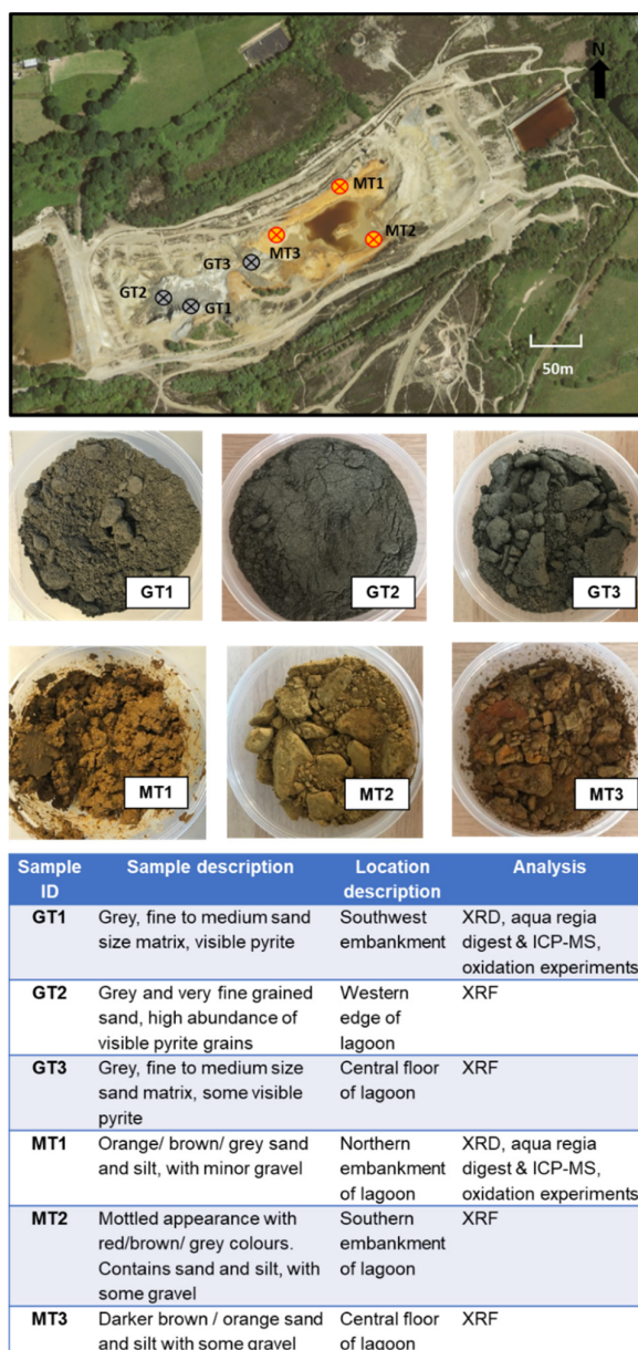
Figure S1. Sample location map for 2019 experiments, modified from: Crown copyright and database rights 2019 Ordnance Survey (Digimap licence); sample photographs; and descriptions of waste samples collected and the analyses performed.

Verity Fitch, Anita Parbhakar-Fox*, Richard Crane and Laura Newsome